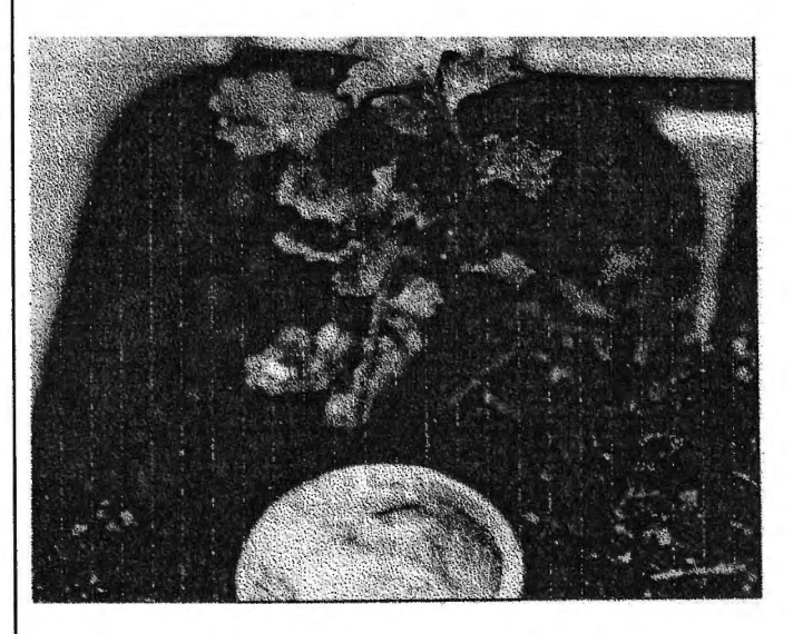
An Aleutian Shield-fern begins to spread its leaves in the UAF Greenhouse. The fern is one of more than 300 of their are species now growing in the greenhouse.

Because of its rarity and possible imminent extinction, the Aleutian shield-fern was designated an endangered species in 1988 and afforded protec\-tion under the 1973 Endangered Species Act. This act prohibits collection or destruction of this fern and limits research to studies that do not jeopardize its existence. The Act also requires that the responsible federal agency develop a plan of recovery to ensure its future and prevent extinction.