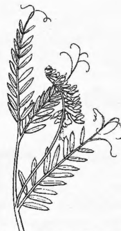
Vicia cracca /Bird Vetch