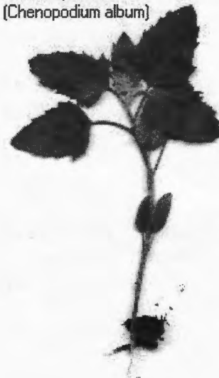
Lamb's Quarters ( Chenopodium album )

This month brings our study of non-native invasive plants to an end, but it also marks the beginning of the gardening season and a time to become weed warriors and take extra measures to eliminate these pests before they become too invasive.