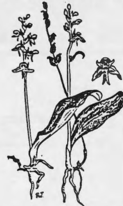
Northern Bog Orchid ( Platanthera obtusata )

a member of the Orchid family (Orchidaceae)