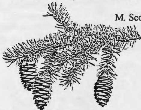
M. Scott Christy

ANPS and the Alaska Aviation Heritage Museum are working together to enhance the museum grounds. This summer ANPS volunteers have planted a variety of hardy native wild flowers. Notable among these is the state flower, the forget-me-not. These little blue and gold flowers were planted inside the spruce's bed near the lake. The society will also be assisting the museum staff in identifying its trees, shrubs and flowers. This information will help the museum provide interpretation for the visitors. In return the museum's conference room will be available for the society's monthly meetings from October to May.